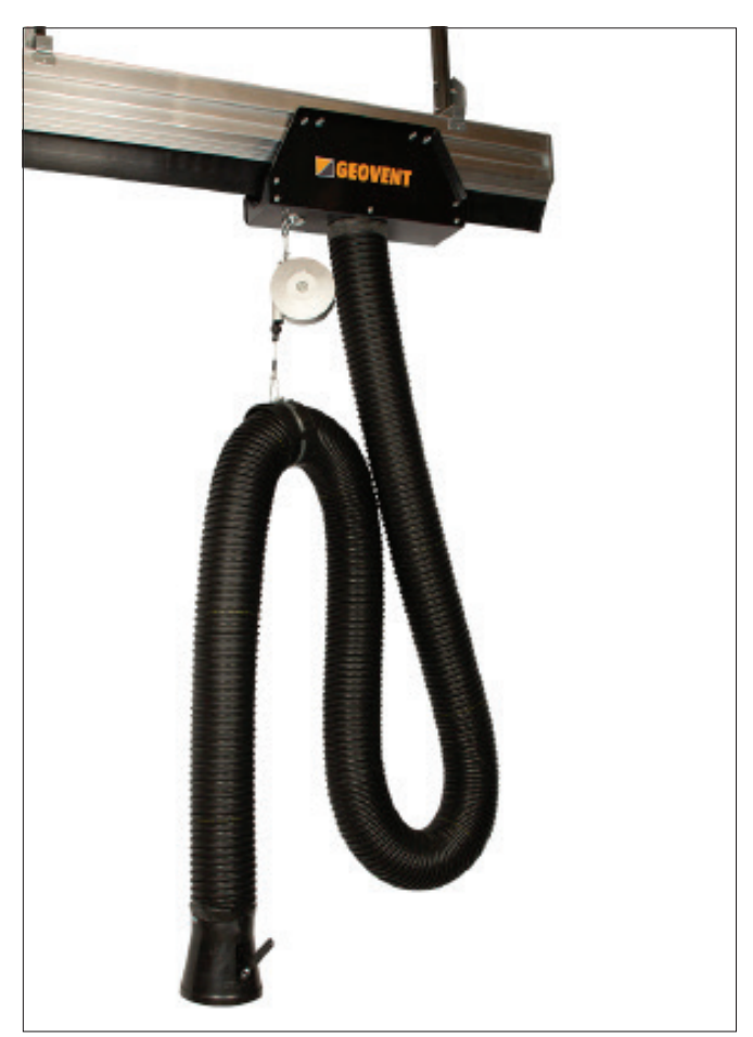
Channel duct type 35